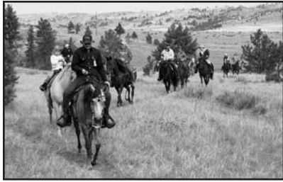
Fort Robinson AHA Trail Ride 2007.

Come join AHA and your friends, four legged and not, on a vacation you'll not soon forget!! AHA is hosting their 3rd annual Fort Robinson Trail Ride Vacation in scenic