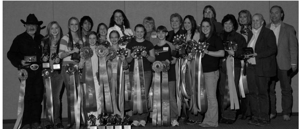
Photos of the winners of the 2006 Region 9 Amateur and Junior High Point Program are now available at equineoutpost.com .